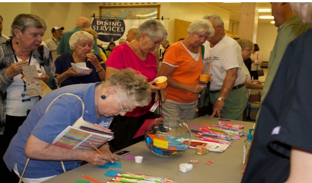
Opening Orientation & Merchant Fair, 2015

It's Also Closed for Memorial Day Weekend: Saturday May 28th—Monday May 30th