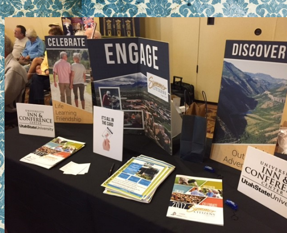
Summer Citizens Booth