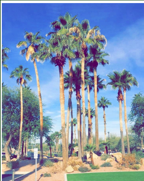
Winter in Arizona

A big shout out to all of the amazing Summer Citizens! Our trips to Arizona and Texas exceeded all expectation. Thank you for your participation in the Summer Citizen Program presentations. We loved seeing past Summer Citizen friends and meeting new Summer Citizens. Also a big THANK YOU to all of the locations that allowed us to give our presentations. We always love our trips and not just because it gives us an excuse to leave the cold of Logan, but because we get to see you!