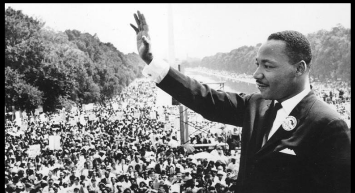
Martin Luther King Jr giving a speech