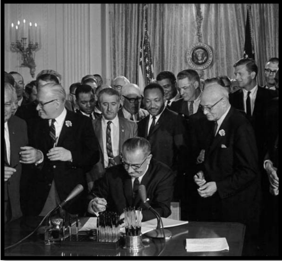
Signing of the Civil Rights Act of 1964

On January 15, 1929 Martin Luther King Jr was welcomed into the world of Atlanta, Georgia. Little did we know that this small baby would one day be one of the greatest leaders and catalyst for social change. Though his life was cut short, he led the nation to the beginning of equality and freedom. Martin attended college and eventually stood out as a public speaker. After the trial of Rosa Parks, he gave a speech showcasing his rhetoric skill and eloquence.