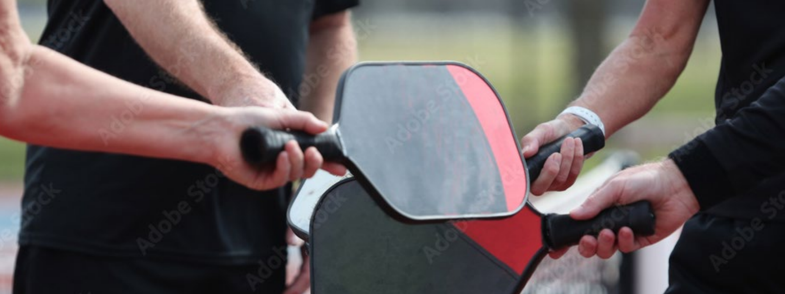
Take your health into your own hands with a course in Health & Fitness

Description: Dreams are filled with metaphors and symbolism. We all dream while sleeping and often wonder what our dreams mean. In this course we'll talk about types of dreams, the purpose of dreams, and how to remember our dreams. We'll share our dreams and work together in small groups to explore the meanings and messages embedded in our mysterious, exciting, and sometimes scary nighttime adventures. Prerequisites: Students should come prepared to share their dreams and fully participate in this interactive small group discussion class.