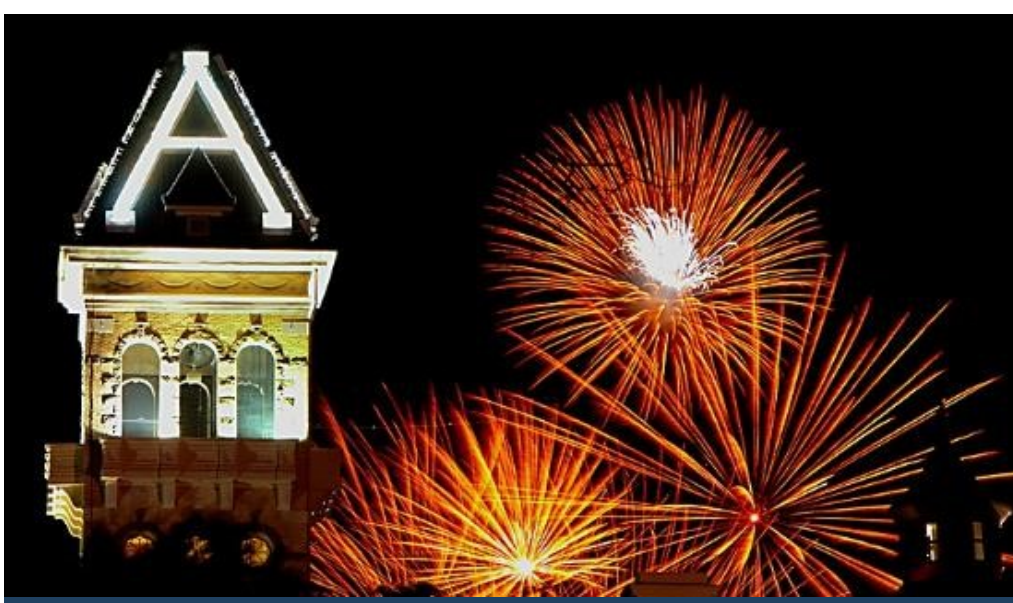
Old Main & Fireworks—Utah State University