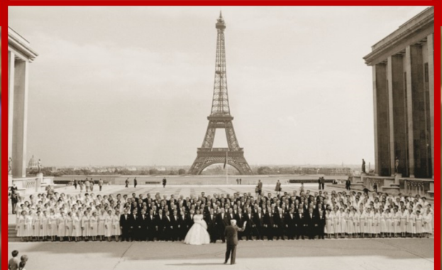
Mormon Tabernacle Choir International Tour Paris—1955

On our tour we will also have time to spend on temple square with its two visitor centers, museums, family history center, famous gardens, and the newly renovated Church History Museum. Sign up today!