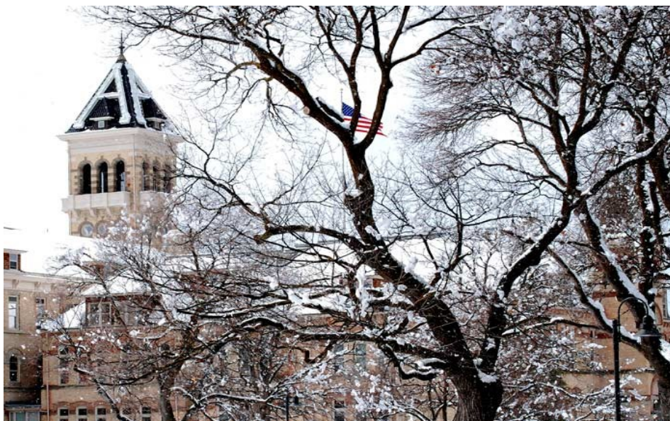
Old Main—Utah State University Campus