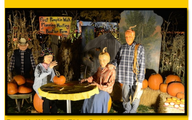
Pumpkin Walk, Elk Ridge Park, Utah