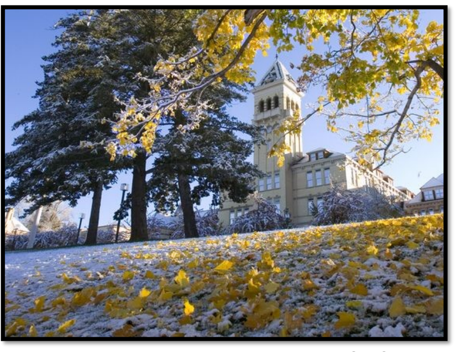
Fall/Winter- USU Old Main

"THE WORLD IS FULL OF WONDERFUL THINGS YOU HAVEN'T SEEN YET. DON'T EVER GIVE UP ON THE CHANCE OF SEEING THEM."