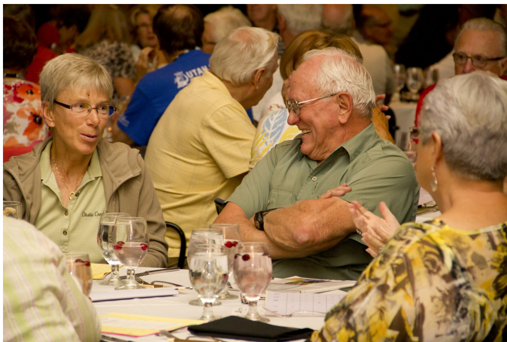
2016 End of Summer Luncheon