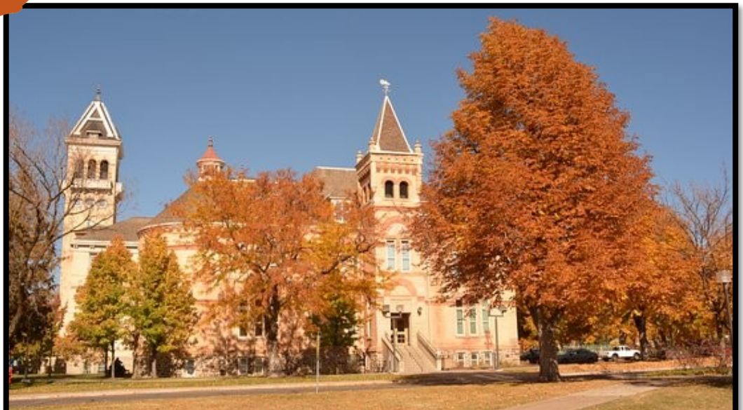
Old Main in the Fall