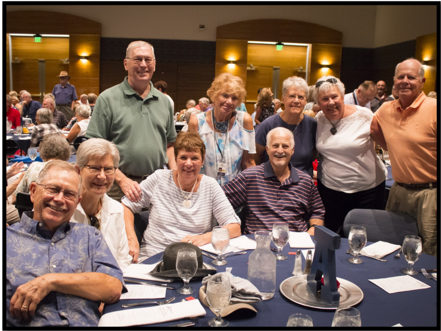
Friends enjoying Closing Social lunch

“There is nothing on this earth more prized than true friendship.”