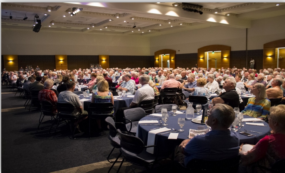
Luncheon & Summer Citizens Got Talent Show August 2017 —Utah State University