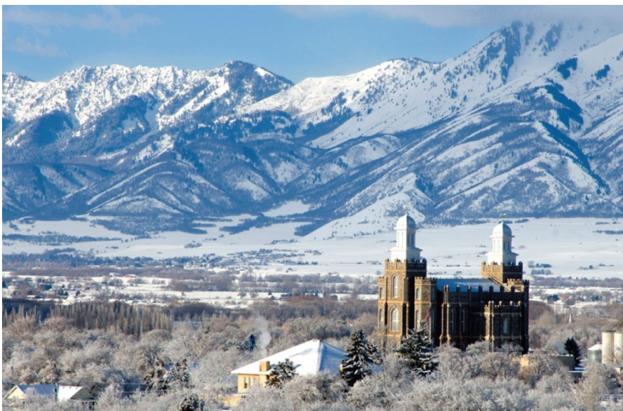
Beautiful Logan temple in the winter

We hope that you each have a lucky month and avoid the leprechauns wanting to steal your gold! We can't wait to see you all in a few months! Get ready for a summer full of new friends, new experiences, and wonderful memories!