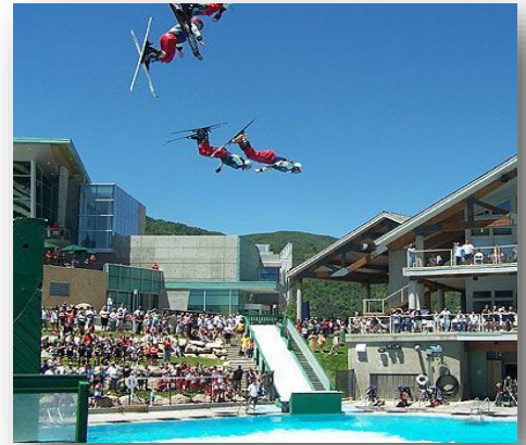
See the ski jump