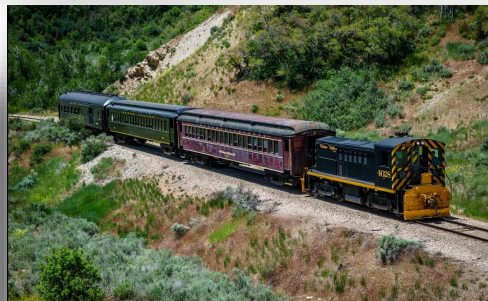
Ride the Heber Creeper