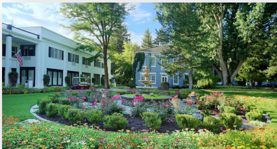
Spend the night at Homestead Resort