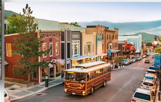
Visit Park City