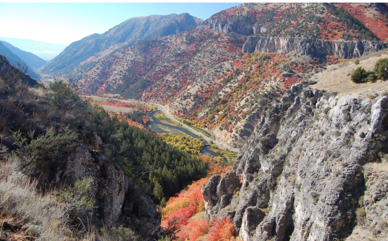
Crimson Trail in Logan, Utah