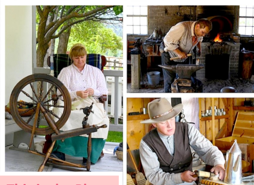
This is the Place Heritage Park

This tour includes visiting This is the Place Heritage State Park located on the East Bench of SLC. Featured at this location: Native American Village, trains with guided tour, Utah's Heritage Quilt Display, Panning for Gold, Arts & Crafts Projects, Historical home, Blacksmiths, and Spinner and Weavers. Next you visit the U of U Natural History Museum where you learn about weather, climate, astronomy, ecosystems, the Great Salt Lake, and past worlds. An Apple Spice box lunch will be included. Call (435) 797-2028 to register for this adventure!