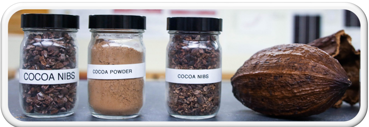
Cocoa Nibs – USU Aggie Chocolate Factory, Logan, UT

throughout the day. Local chocolate makers Blommer and Callebaut, Aggie Chocolate Factory researchers and internationally recognized chocolate makers, held short presentations on the business, art, and science of chocolate making throughout the expo. Not only were samples of Aggie Chocolate and chocolate-seasoned meat showcased at the expo, but a brand new flavor of Aggie Ice Cream, affectionately called "The Scotchman," was debuted at the Aggie Chocolate Expo. The Expo was a flavorful event to have on campus this fall!