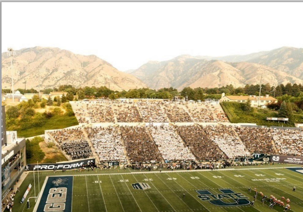
Maverik Stadium—Utah State University