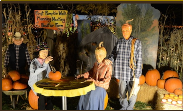
Pumpkin Walk, Elk Ridge Park, Utah