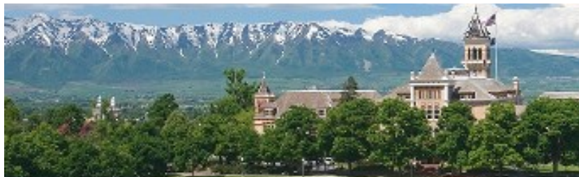
Old Main and the Wellsville Mountains