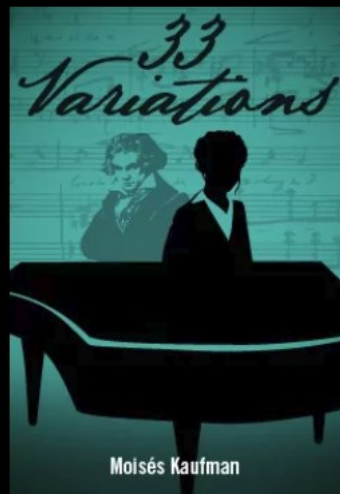
33 VARIATIONS JULY 2021