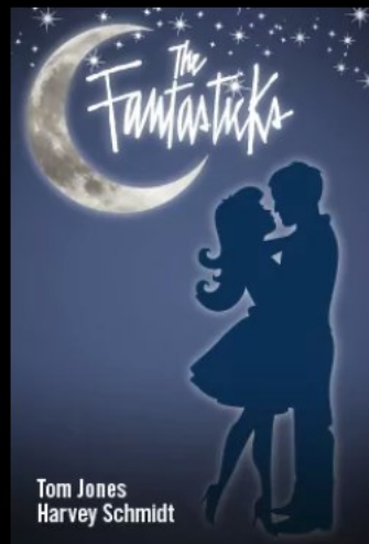
THE FANTASTICKS JULY 2021