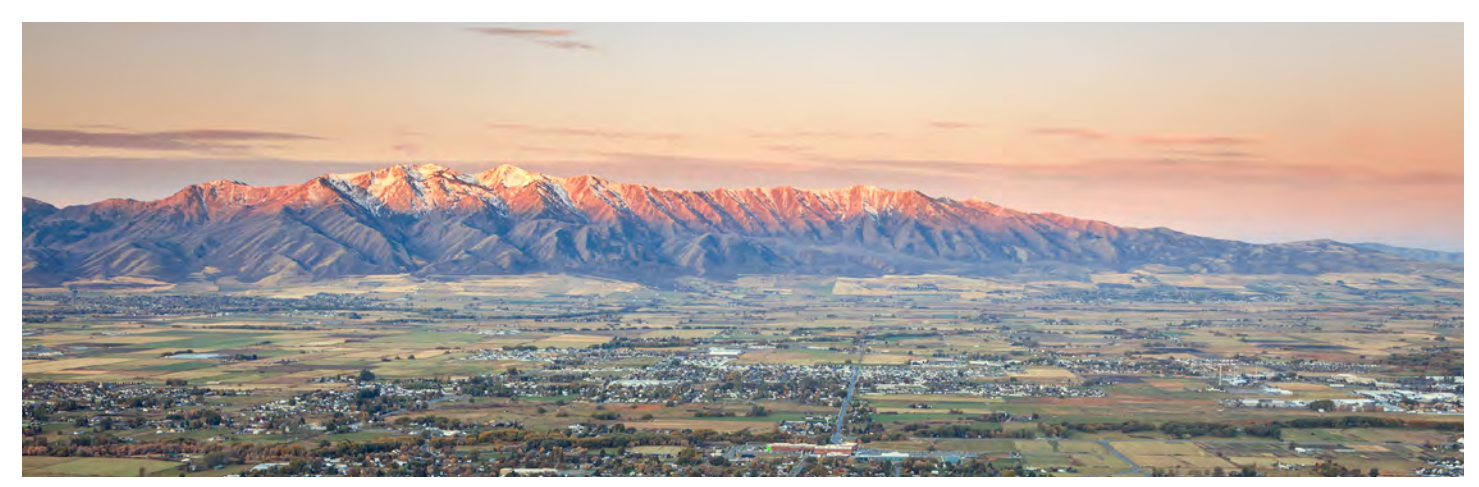
Your summer home awaits in the beautiful Cache Valley

Housing Sponsors Make your housing reservations today by contacting one of the properties listed below. All sponsored housing include the Summer Citizen ID card with the summer lease/rental.