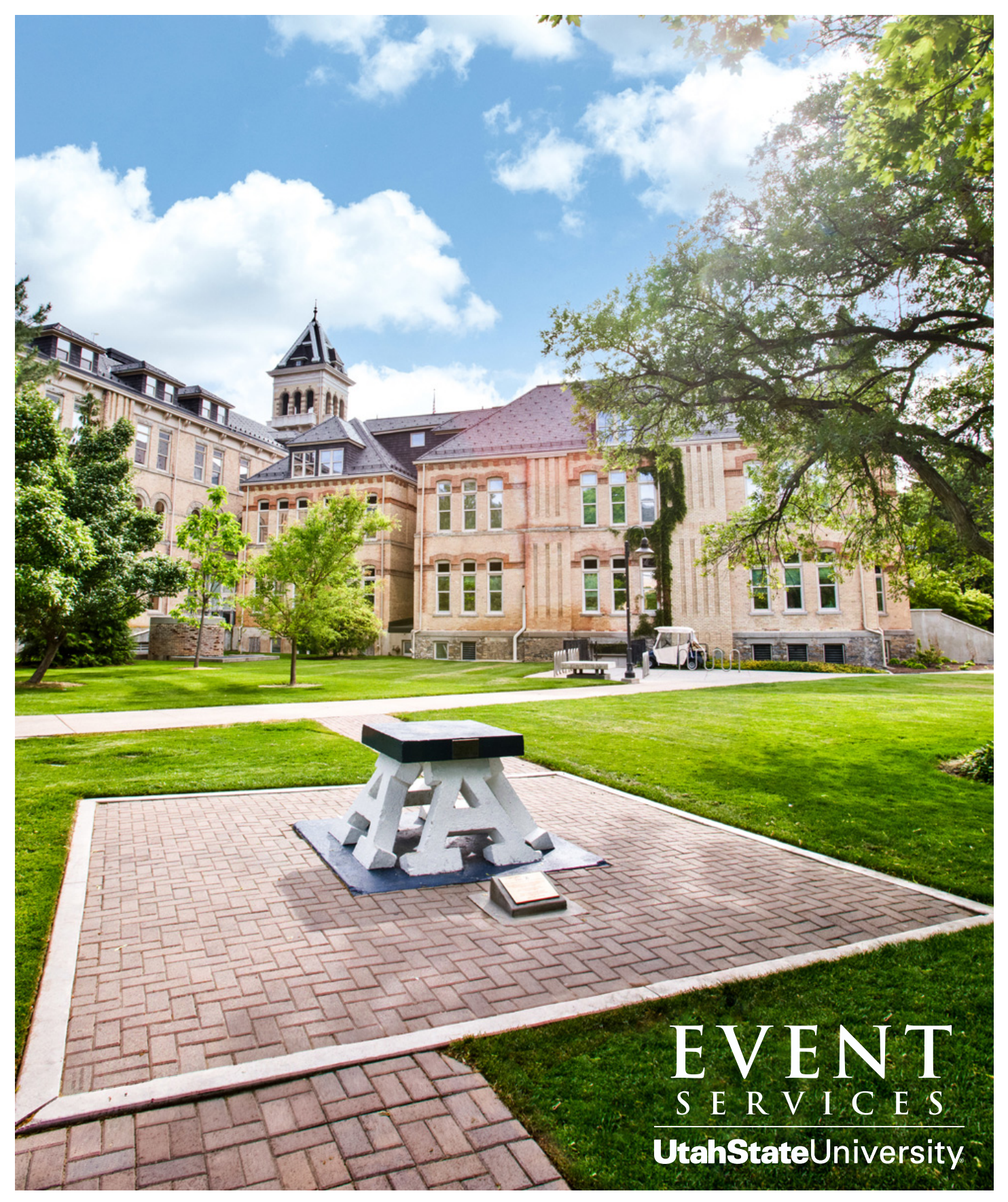
The Summer Citizens Program Is Presented By Event Services At Utah State University®