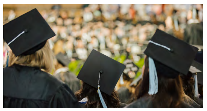
Join us in celebrating our graduating seniors at USU's 134th Commencement