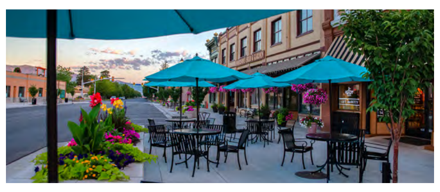
Cache Valley can't wait to welcome Summer Citizens back