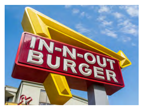
Logan is getting it's own In-N-Out Burger as well as other restaurants in 2021!