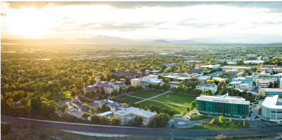
The cold winter days are coming to a close; summer is fast approaching.