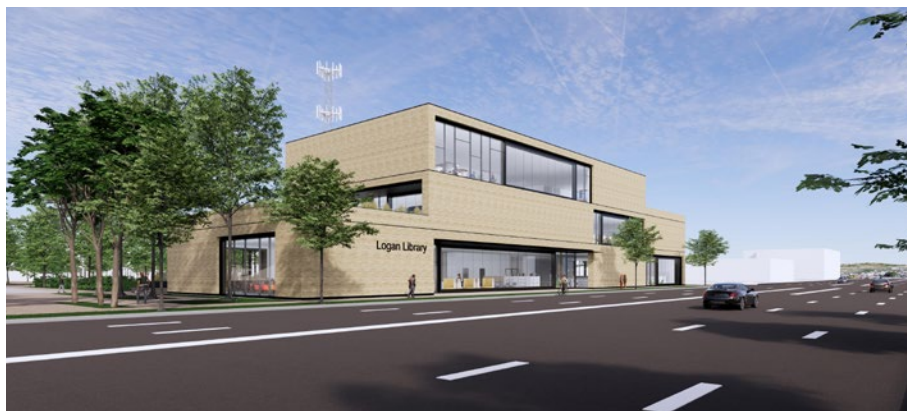
Architectural Renderings of the new Logan City Library