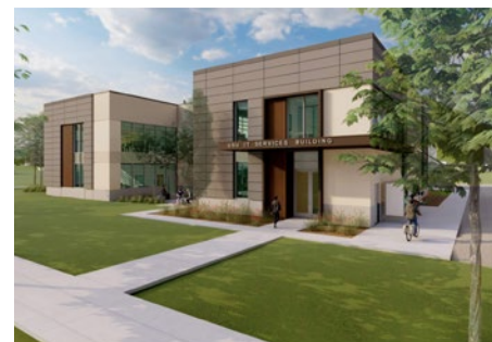
New IT Building on USU Logan Campus

Starting in 2024, Utah State University students can complete a four-year veterinary degree. In early March, the Utah Legislature approved $18 million for the development of the USU veterinary program. The money will help to expand it into a full college and fund development of curriculum. Currently, USU is part of a regional veterinary program. Each year, 30 students are admitted into the program, 20 of whom must be Utah residents. These students complete two years of schooling at USU and then another two years at Washington State University for clinical work. Not only will the new college allow those students to complete all their schooling and clinical work in Utah, it will also open the program for more students. When it is fully completed, 80 students can be admitted each year.