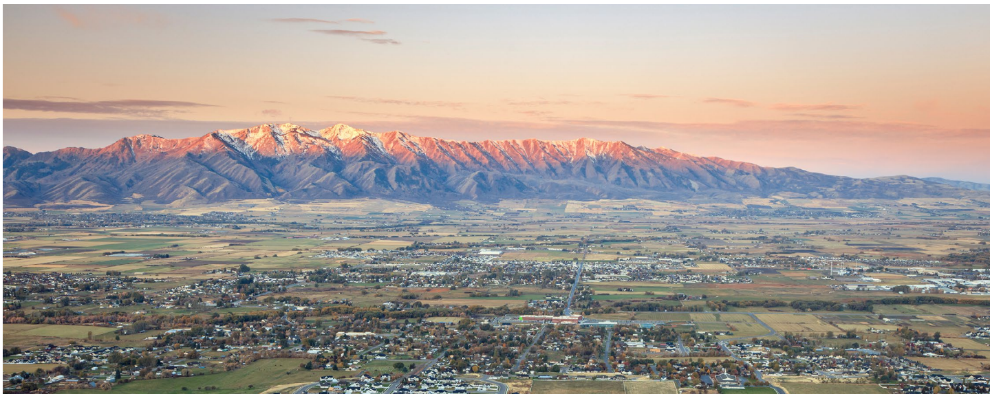
Cache valley is more than just Utah State University and Logan City; come visit all the spectacular mountainous views in our backyard!