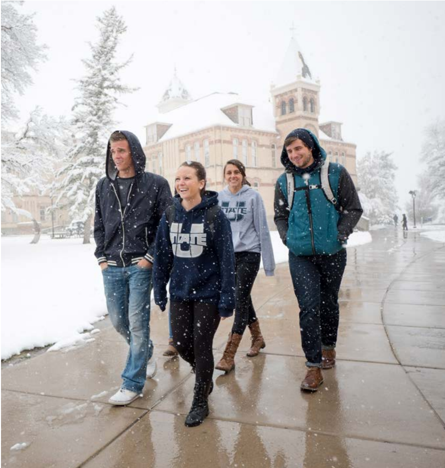
Students are back for Spring Semester, but so is the snow!