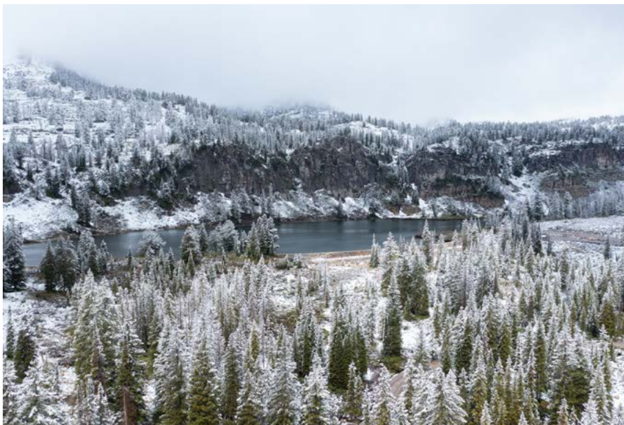
Logan Canyon may be covered in snow now, but come spring it will be lush and green!